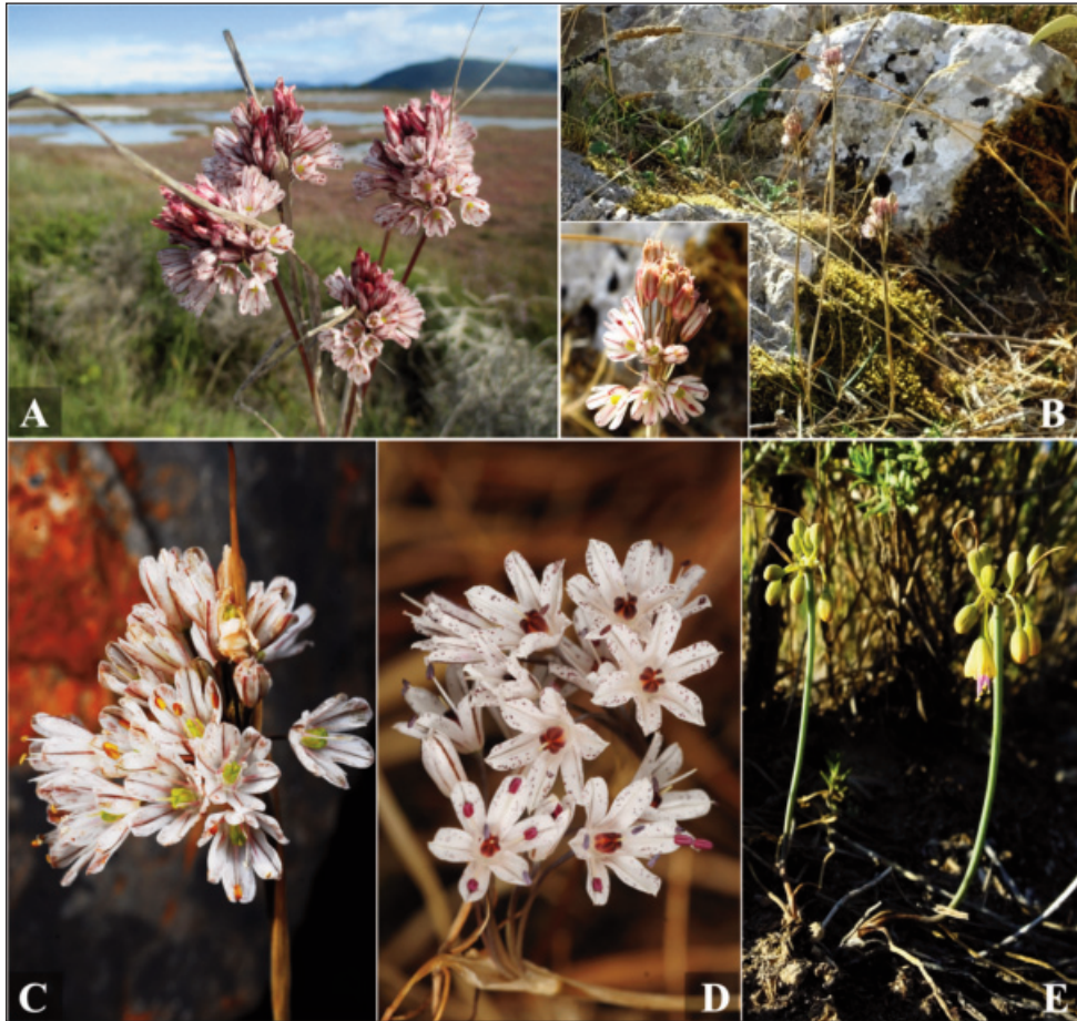
Fig. 1. Allium taxa studied: A , Allium callimischon subsp. callimischon on stagnate place (Gyra) and B , on rocky limestone (Mt. Stavrotas) from Lefkada island; Inflorescences of A. callimischon : C , subsp. callimischon from Lakonia (Peloponnese) and D , subsp. haemostictum from Crete; E , Individuals of Allium flavum subsp. tauricum from Mt. Mega Oros, Lefkada.

Karavokyrou (1994) reports 2n = 16 for populations of subsp. tauricum from Lesvos isl. (East Aegean). However, Özhatay (1990) describes a tetraploid karyotype ( 2n = 4x = 32 ), in material from Turkey, consisting of five sets of metacentrics, one set of submetacentric and two set of acrocentrics, with one of them bearing a satellite on the short arm.