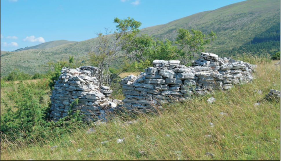
Fig. 4. Hut with a circular plan, remains of the perimeter walls (Photo F. Pedrotti, 2018).

Saxifraga tridactylites , Draba verna , Alyssum minus , Arenaria serpyllifolia , Thlaspi praecox and Cerastium brachypetalum .