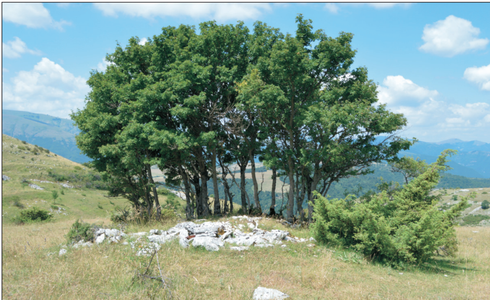
Fig. 5. Remains of a collapsed hut on which the association Milio vernalis-Aceretum campestris has developed; on the right a plant of Juniperus deltoides.