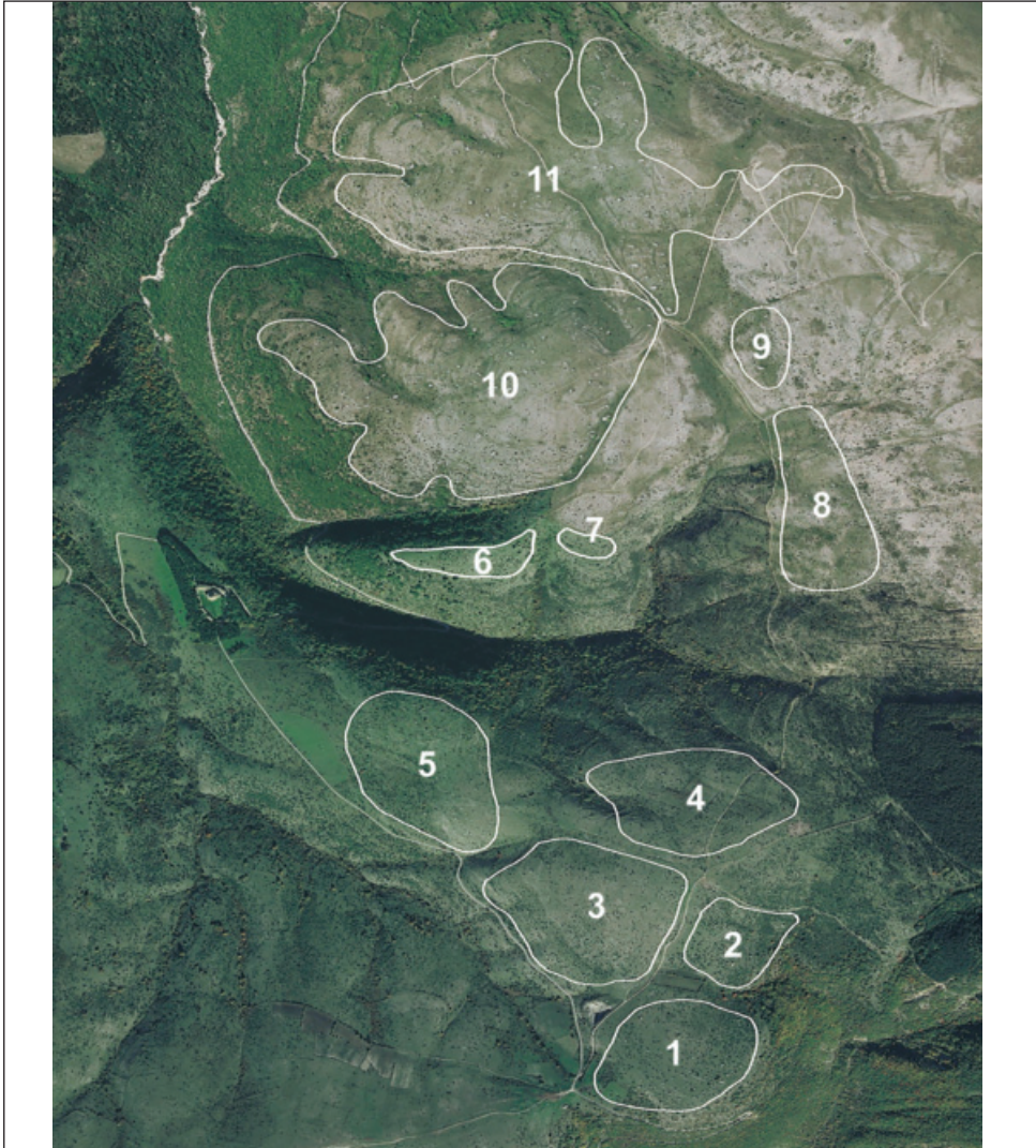
Fig. 2. The dry-stone hut villages of the Macereto Plateau; the meaning of the numbers is the same as in the previous figure (satellite image).

the Marche called “spianche”) placed in the grass where the salt was spread; and macere , heaps of stones that had been removed. The arette are the same as those found on Monte Cardosa, not far from Macereto (Rosi 2005), where some are still well preserved. The spianche are similar to those found at the Pian Grande of Castelluccio di Norcia and on the Montagna di Torricchio (Cortini Pedrotti & al. 1973; Pedrotti 1981).